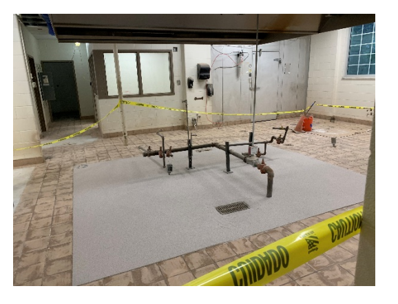
Epoxy Flooring in Kitchen